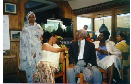
Panelists answer resident questions on child rearing and home remedies.

This year's first immersion day was well attended. Over 55 pediatric residents and faculty participated in this unique opportunity to learn more about the continental African refugees who live in San Diego County.