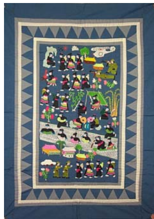
A Hmong Wall Hanging depicts the Hmong leaving Laos, crossing the Mekong river into Thailand.

"I am truly excited about being involved in a training initiative that is collaborative between UCSD and most importantly the community"