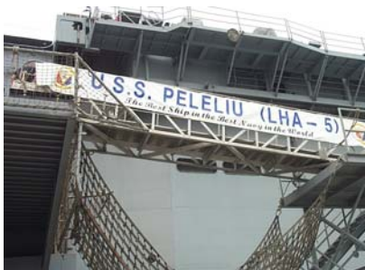
The fourth Immersion Day took place aboard the USS Peleliu.

Special thanks to our hosts Bayside Settlement House, Barona Reservation, Hospital Infantil de las Californias, and the U.S. Navy.