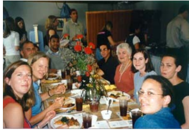
Residents enjoy traditional Somali and Ethiopian food at this year's first immersion day.